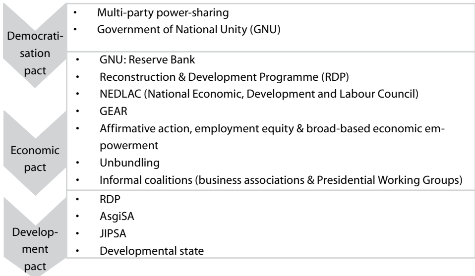
Diagram 1: Coalitions and pact-making in South Africa (1994-2008)

The paper argues that ANC elites successfully achieved the political transition required by the democratisation pact, and that its economic pact achieved transition and transformation through transaction with elites from white and black capital. The triangular state-business-labour relations eventually evolved into a key factor in South Africa’s transition. Evidence suggests that the economic pact not only entrenched the power of white capital, but also that of new black capital. Despite the ANC government’s delivery of social goods, this has not been on a sufficient scale thus far to undo the legacies of apartheid.